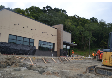
Panera Bread building under construction