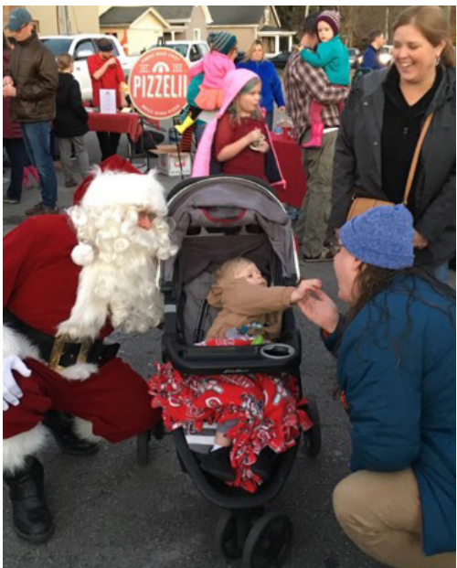
New community events sponsored by Columbia Township are bringing unity.

stories we can point to—Cincinnati Belting and Transmission (CBT), Fifty West, the new Panera, and other small businesses that have chosen Columbia Township as their home. In our minds, this is just the beginning. Our township motto is "Growing Together." I feel that we've all grown together in the last few months and years. We are a unique community to be sure, especially if you look at just our geography alone. Yes, we have a lot of differences and many of us identify with our specific neighborhood. But I feel a movement in our community—we all fall under the same umbrella. We are all part of Columbia Township. I am proud to be a part of that, and I hope you are too!