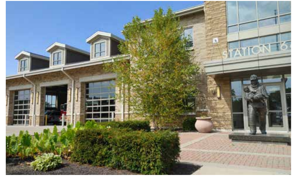
Little Miami Joint Fire & Rescue District fire station on Wooster Pike

"After December 31, 2021, the Little Miami Joint Fire & Rescue District will Continued on page 4